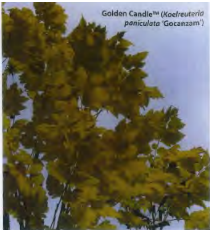
Golden Candle™ ( Koeleruteria paniculata 'Gocanzam')